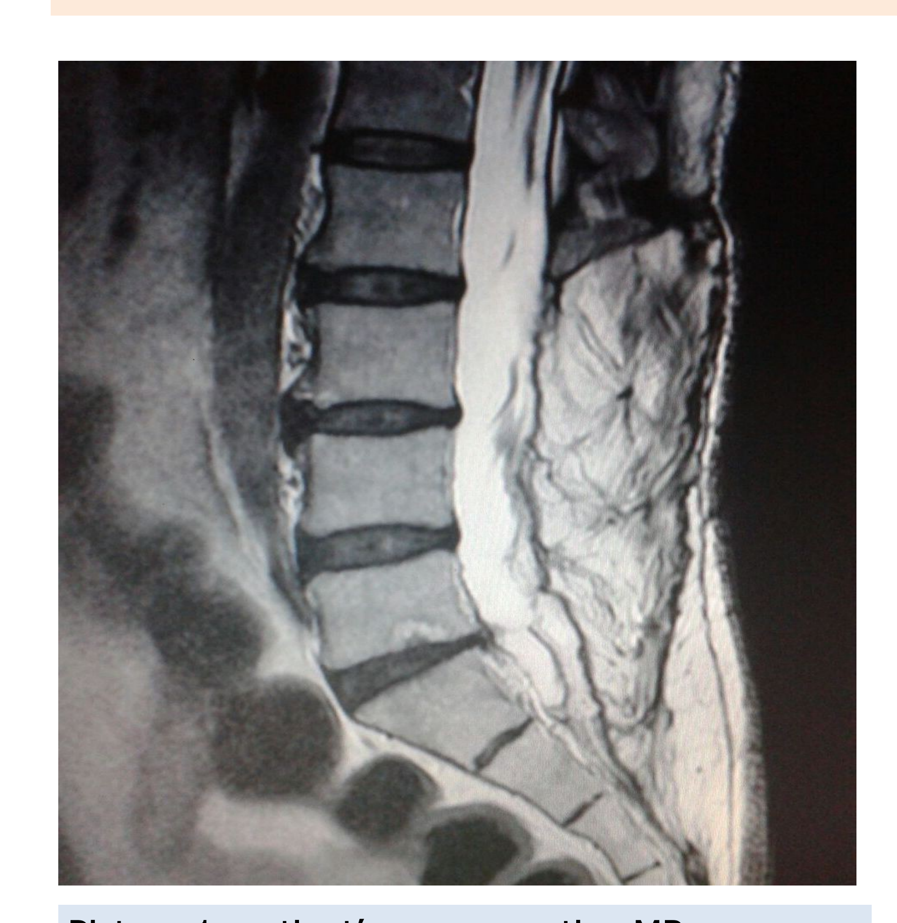
Picture 1: patient's proeoperative MR imaging, He doesn't have L2-S2 spinosus processes.

We noticed that, the electrode was directed to the anterior epidural space on lateral fluoroscopic screening although various manipulations. The fibrotic tissue due to the previous gunshot would prevent the appropriate placement of the electrode. Furthermore, we thought that the postoperative headache and tinnitus may have caused by epidural injury due to the repetitive attempt ions.