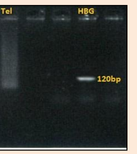
Figure1. Agarose gel electrophoresis following PCR with the tel 1 and tel 2 primers and HBG primers.

The relative leukocyte telomere length (T/S) of azoospermic men was found to be significantly lower (95% CI, p<0.05) when compared to controls (0. 54 vs. 0.84) meaning telomere length in the case group was significantly lower than those of the control group (95% CI, p<0.05).