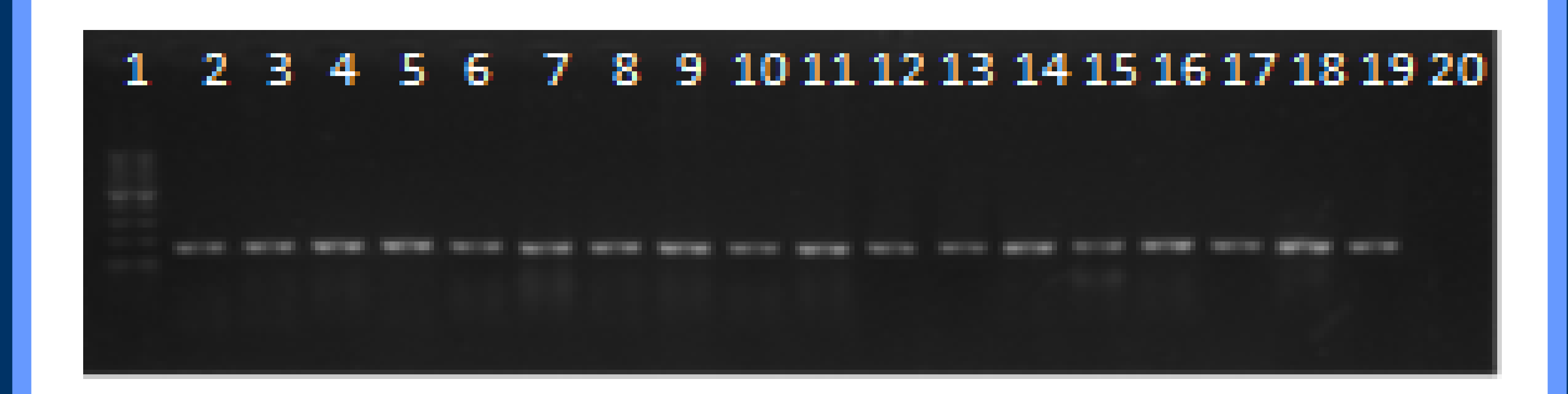
FIGURE 3. Electrophoresis in agarose gel 2% of PCR products for cylB ene. First lane, molecular weight marker, K562 DNA Molecular Weight [10 ng/ul] Promega Madison, Wi USA— lane 2 to 19, Streptococcus agalactiae strains: —last lane, negative control.