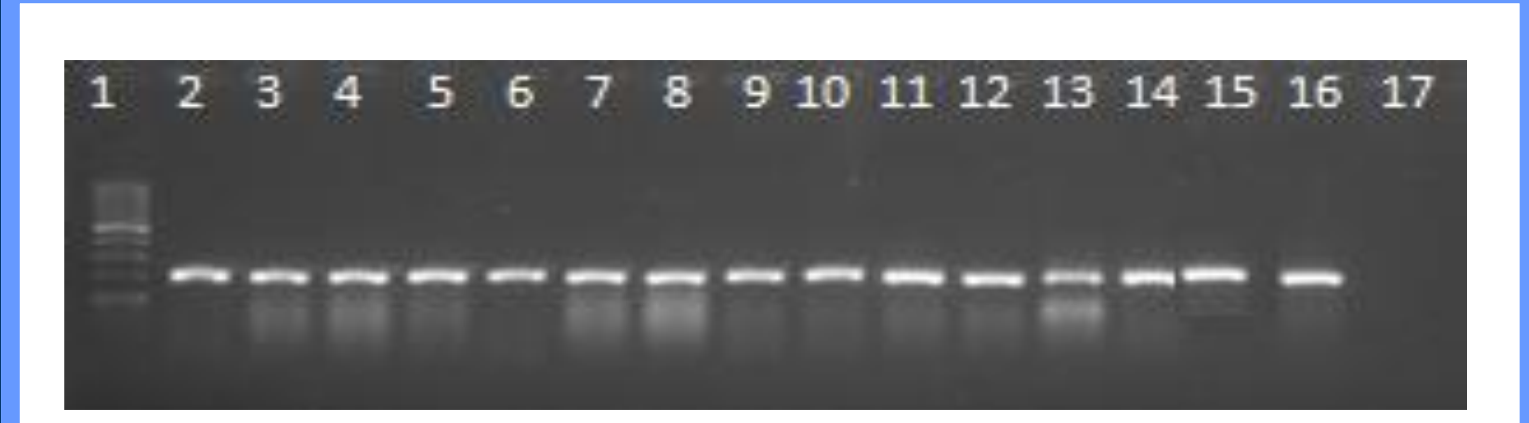
FIGURE 2. Electrophoresis in agarose gel 2% of PCR products for cspB gene. First lane, molecular weight marker, K562 DNA Molecular Weight [10 ng/ul] Promega Madison, Wi USA— lane 2 to 16, Streptococcus agalactiae strains: —last lane, negative control.