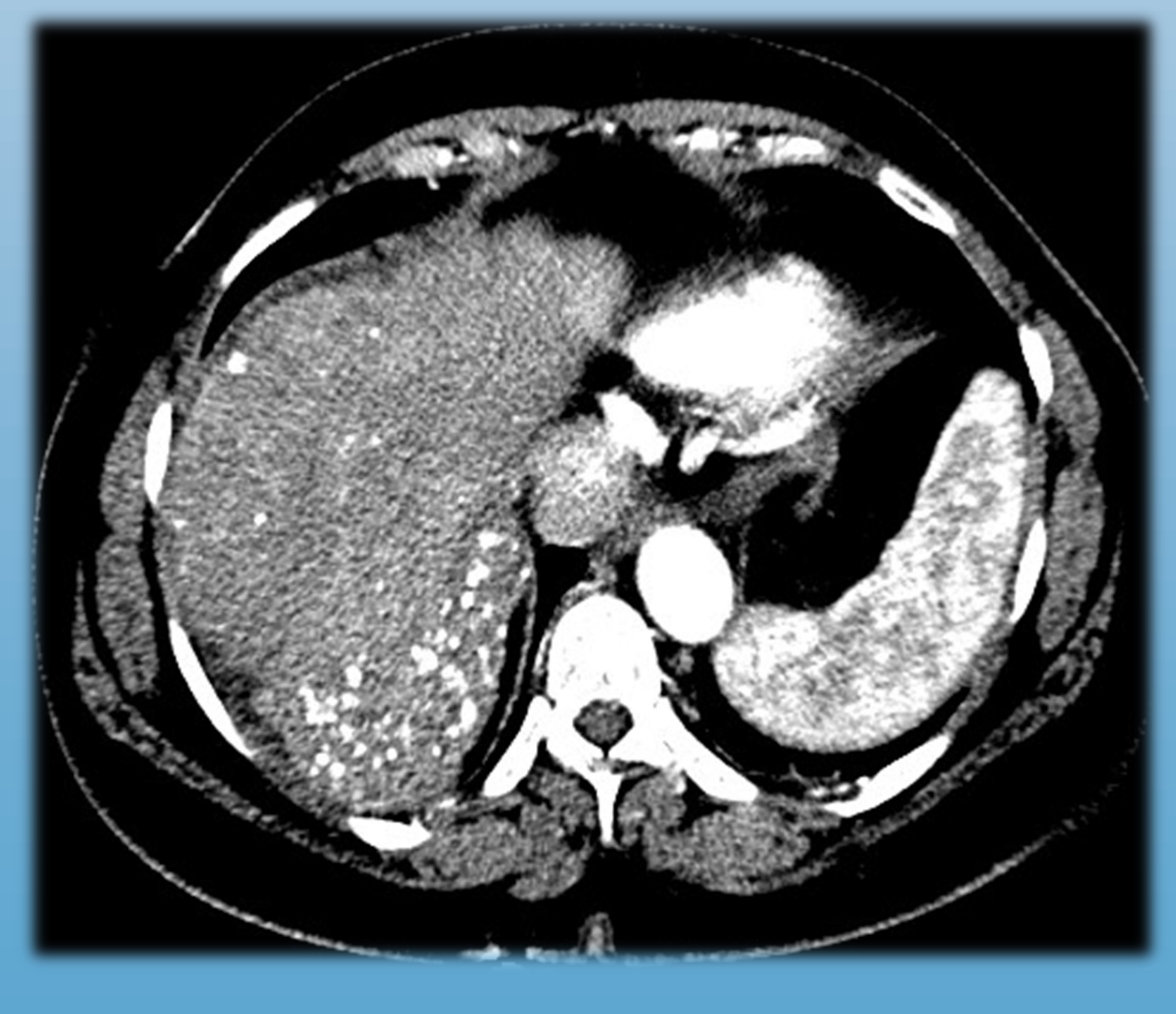
Figure 3 Contrast-enhanced axial CT image obtained at arterial phase demonstrates multiple multiple tiny calcified nodules in the liver which represent distrophic calcifications of necrotic tumor nodules. There was no enhancing lesion seen in the liver indicating complete radiographic response to embolization and subsequent chemotherapy treatments