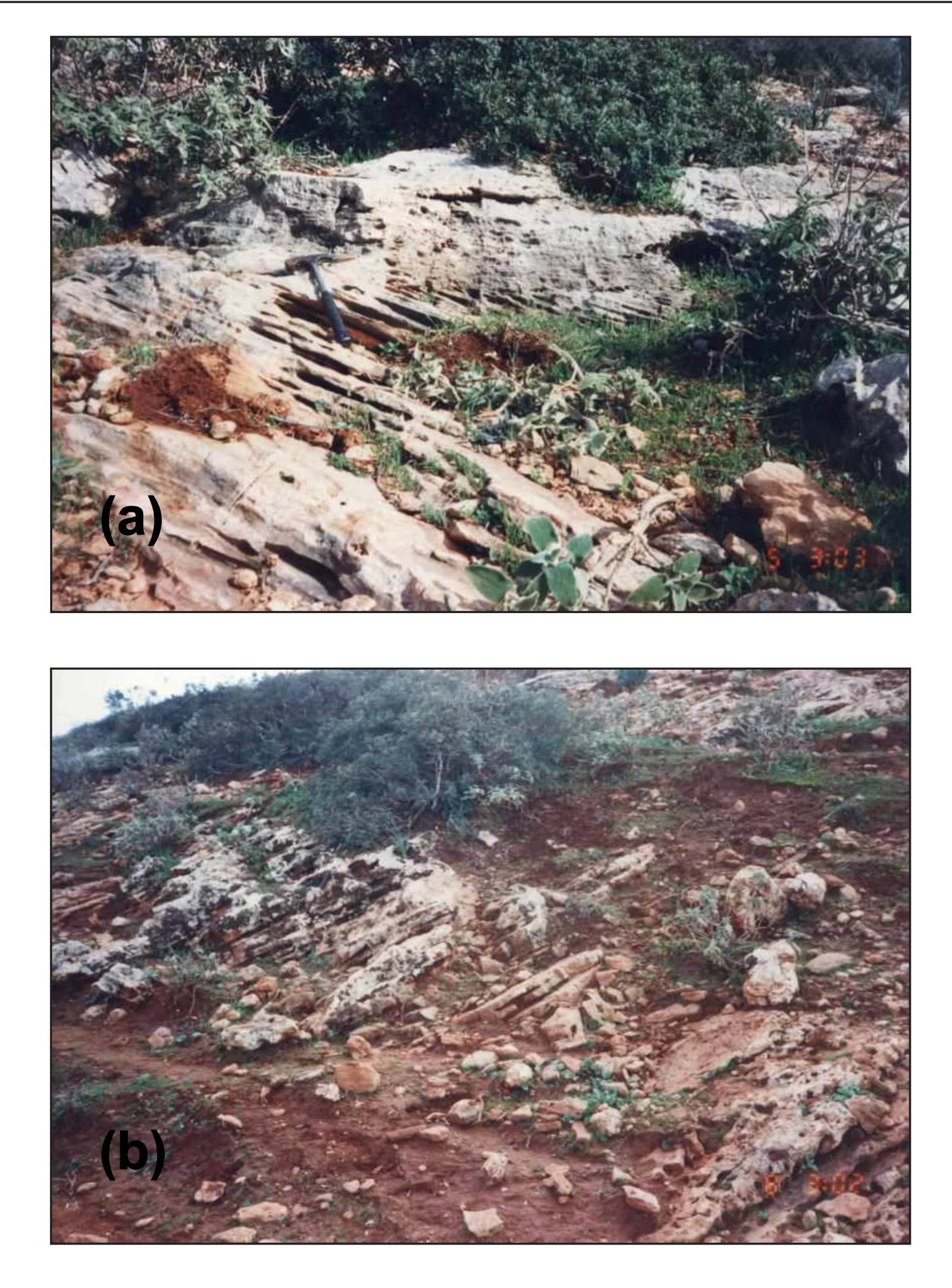
Figure 4 Field photos for the small and large scale cross bedding in the oolitic grainstone of the Miocene sequence, al-Qattarah Formation, Cyrenaica, NE Libya

Figure 1 Location and geological maps of the Miocene sequence, al-Qattarah Formation, Cyrenaica, NE Libya